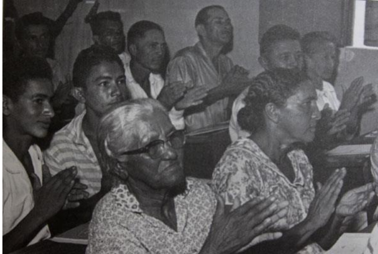
Figure 1: Angicos, rural area in Northeast Brazil, the first classroom in which Paulo Freire used his teaching method. 20

The military had no interest in having a population of capable critical thinkers. Their interest was to have students prepared to be part of the working force. As shown in Figure 2 and 2.1, students are in a classroom where they learned facts (on the blackboard: Brasilia is the capital city of Brazil) and from a textbook. According to Beluzo and Toniosso, education conceived in the dictatorial period, which lasted until 1985, was technologist, that is, focused on the training of labor for the job market, the preparation of the individual. 21 With the end of Paulo Freire's literacy program by the military government in 1965 and the persecution he suffered because of his ideas of justice and equality, he had to go into political exile in Chile.