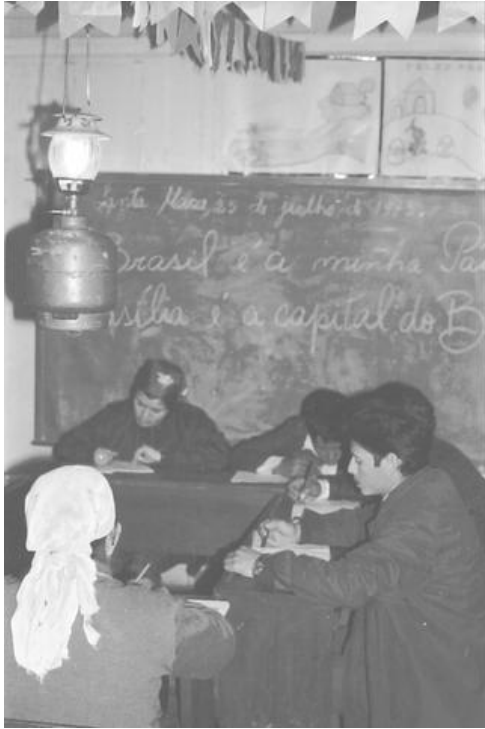
Figure 2: Classroom in Santa Maria, in 1973. 22