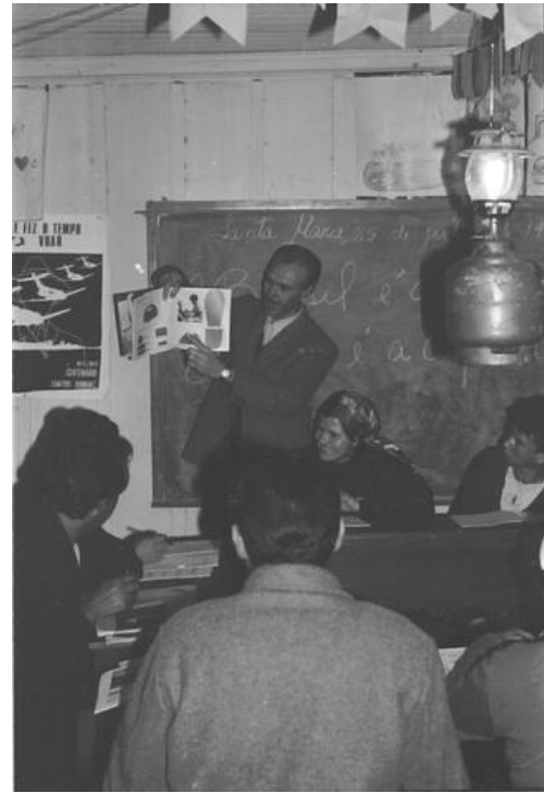
Figure 2.1: Learning from technical books. 23