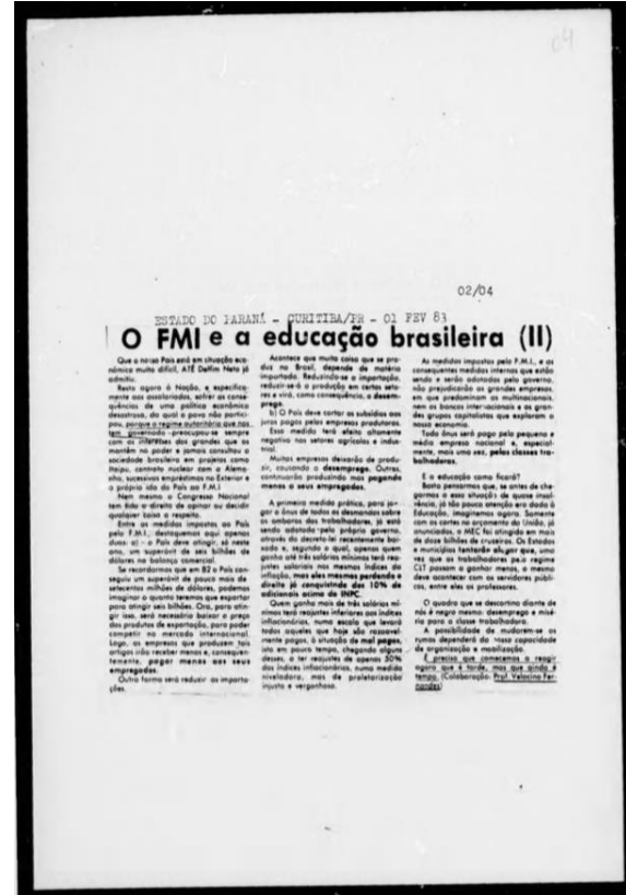
Figure 5: First article written in January of 1983. 26